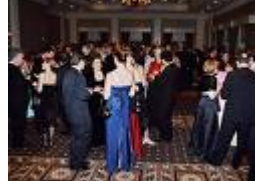
3 Down: Big parties