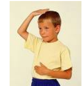
12 Down: Touch your head