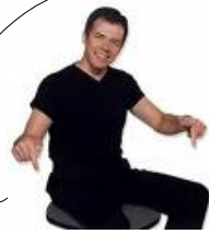
7 Across: Your legs when you sit down