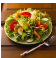
13 Across: Lettuce dish