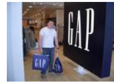
22 Across: Clothing store