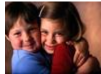
8 Down: Buddy or friend