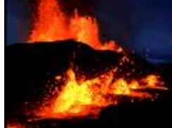
2 Down: Melted rocks