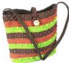
17 Down: Thing to carry