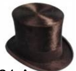
21 Across: Head cover