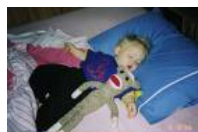
9 Down: Sleep time