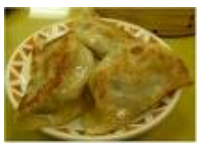
6 Across: Chinese food appetizer