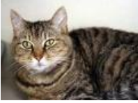
15 Down: Furry mammal