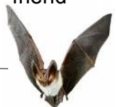
11 Down: Winged mammal