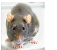
18 Across: Rodent