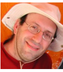
25 Across: Father