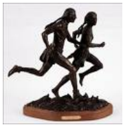
6 Down: Won a race