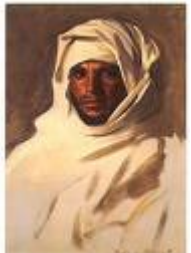
10 Across: Person from the Mid-east