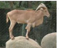
18 Down: Its horn is used for a shofar