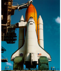
9 Across: They run the shuttle