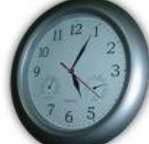
2 Across: Delay