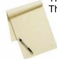
20 Down: A bunch of paper