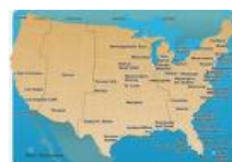
19 Across: Road picture