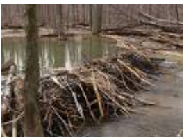
14 Down: Beavers build it