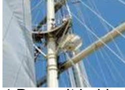
4 Down: It holds a ship's sails