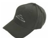
15 Across: Baseball __