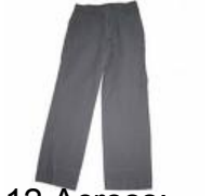
12 Across: Legs clothing